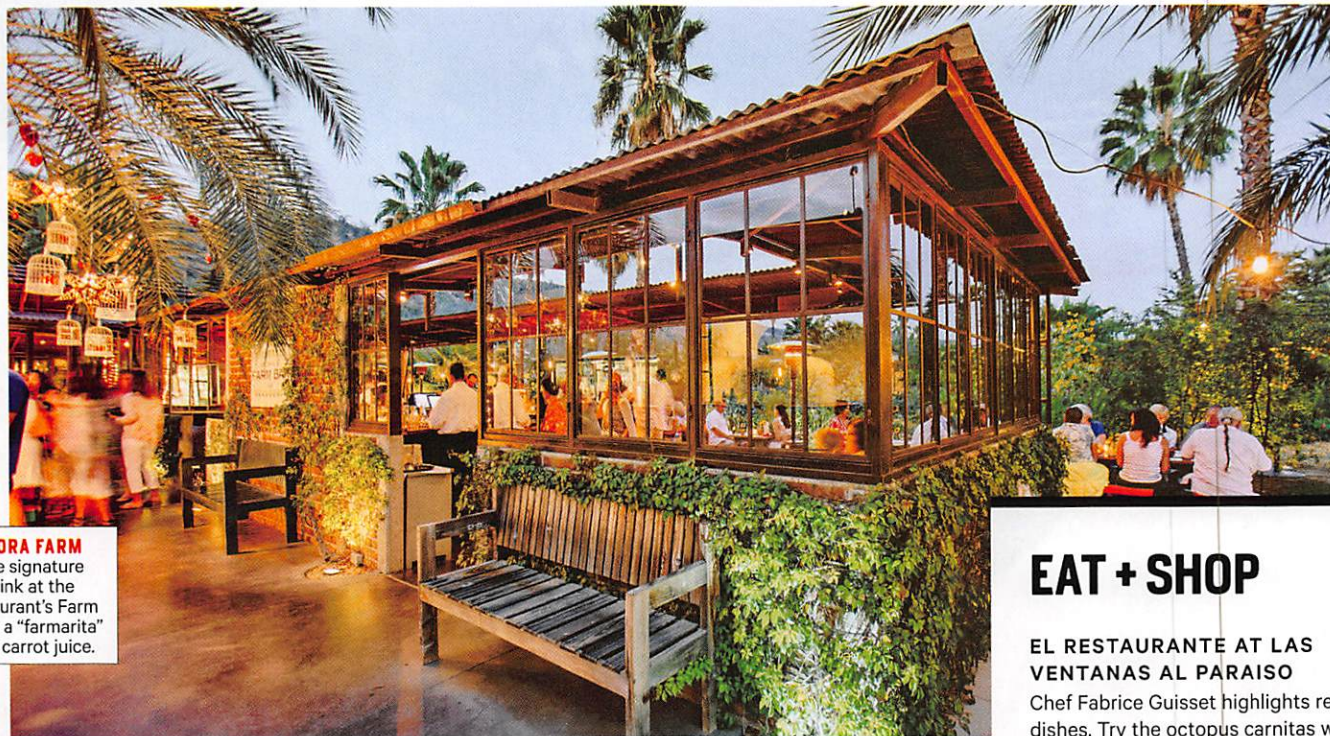
FLORA FARM The signature drink at the restaurant's Farm Bar is a "farmarita" with carrot juice.

now found throughout the area. After Odile, Rosewood shut down the property for nine months, spending $30 million to repair its seven pools, 83 suites, and 12 villas. The decor remains similar to the hotel's pre-Odile look, with Otomi bed scarves and mosaic headboards. The four two-bedroom beachfront villas are still what to request.